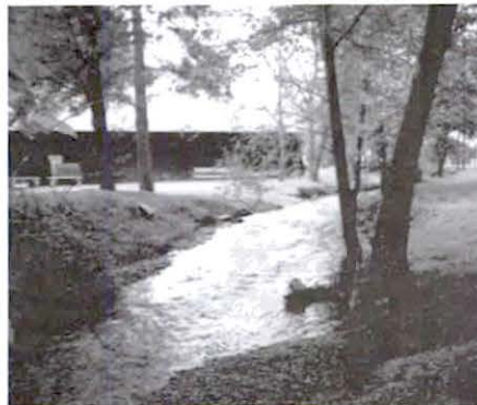
Volunteers will plant natural vegetation along Des Moines Creek in Des Moines Beach Park.

To register and for information please e-mail: Friendsdmc@AOL.com or leave a message at (206) 878-6355.